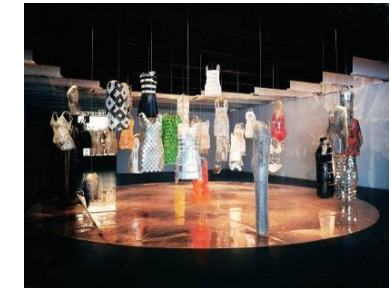
24 Paco Rabanne 25 september – 3 november 2002