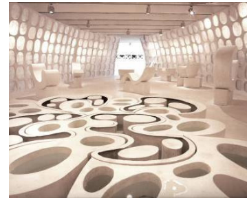
23 Kris Ruhs "Installation" 4 april – 6 may 2001