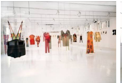
25 Omaggio a Rudi Gernreich 8 october – 15 november 1998