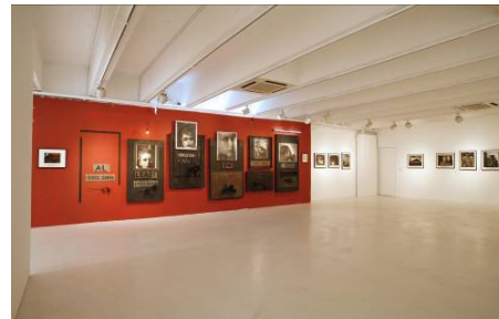
12 Sarah Moon 4 november – 3 december 2006