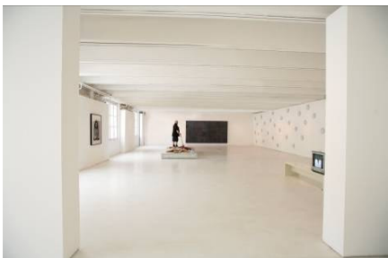
16 Urs Luthi 3 november – 2 december 2007