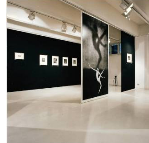
6 Frantisek Drtikol 1 – 31 December 1995