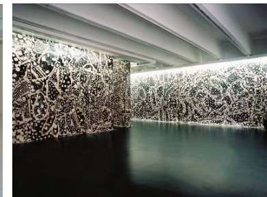
27 Kris Ruhs "One room" 11 april – 5 may 2002