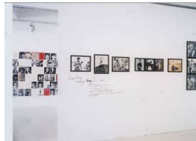
14 Bruce Weber 24 september – 2 november 2003