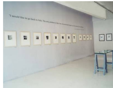
17 Francesca Woodman 8 – 26 march 2006