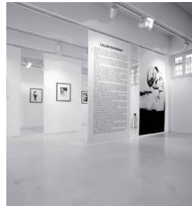
11 Lillian Bassman 14 october – 15 november 1993