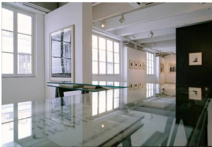
10 Walker Evans 14 january – 19 february 2006