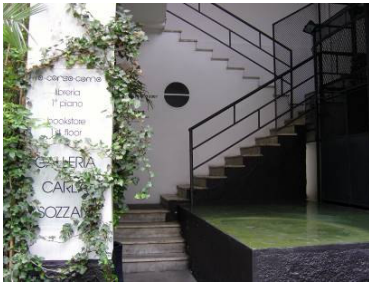
1 Gallery entrance

Galleria Carla Sozzani opens in 1990 in Milan, devoted to art, photography, design and architecture. The gallery is located in a former industrial building, typical of the Milanese architecture. Since its opening, Galleria Carla Sozzani has established itself as one of the most important photography galleries in Italy. Over 190 exhibitions have been shown at the presence of famous photographers, often presenting works that had never been shown in Italy before: Helmut Newton, Annie Leibovitz, Bruce Weber, Bert Stern, Sarah Moon, Paolo Roversi, David Bailey, Don McCullin, Hiro, David LaChapelle, amongst others. Twice a year the gallery presents an exhibition related to architecture and design. Amongst them: Franco Albini, Carlo Mollino, Verner Panton, Jean Prouvé, Serge Mouille, Yayoi Kusama. Fashion exhibitions like the ones on Pierre Cardin, Courrèges, Paco Rabanne, Zandra Rhodes and Martin Margiela have been presented as well. Next to the gallery, the bookshop presents a wide selection of new and classic publications on art, architecture, design, graphics and fashion, with a strong emphasis on photography. The gallery has its own publishing company, Carla Sozzani Editore, also dedicated to art, photography, fashion and design.