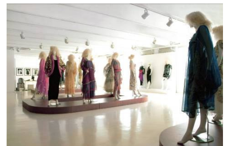
30 Zandra Rhodes 28 september – 30 october 2005