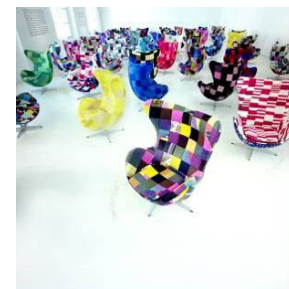
29 Arne Jacobsen 15 – 27 april 2008