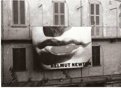
7 Helmut Newton 3 october – 10 november 1996