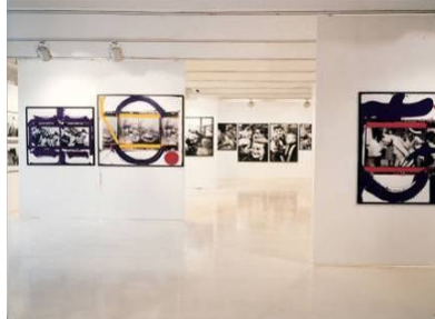
5 William Klein 8 November – 17 December 2000