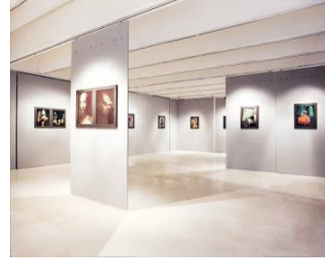
9 Paolo Roversi 24 february – 19 march 2000