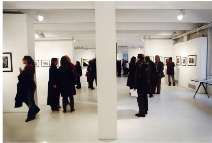
2 Gisèle Freund 12 January – 24 February 2008