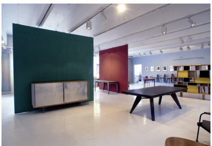
28 Jean Prouvé 12 – 22 april 2000