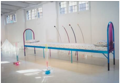
22 Shiro Kuramata 9 april – 11 may 2003