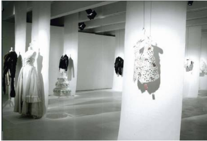
19 Maison Martin Margiela 10 february – 4 marc 2007