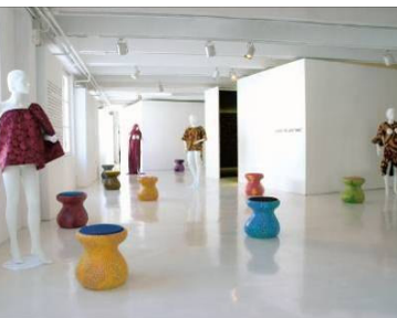
26 Yayoi Kusama 13 april – 1 may 2005