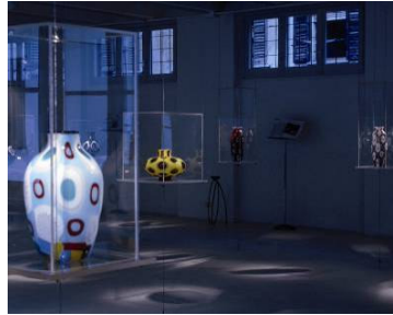
20 Venetian Glasses 27 may – 29 june 1991