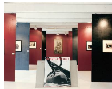
18 Alexander Rodchenko 7 march – 14 april 1996