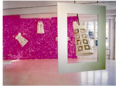
21 Courreges 4 march – 3 april 1999