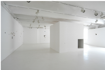
4 Masao Yamamoto 8 September – 28 October 2007