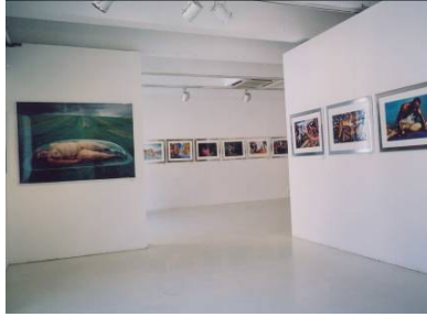
8 David LaChapelle 24 september – 4 november 2001