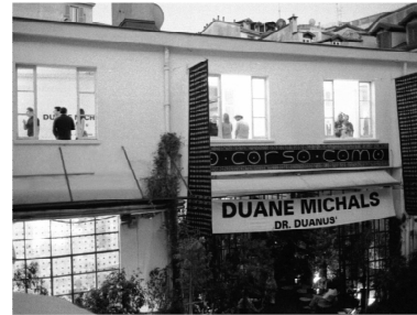
3 Duane Michals "Dr. Duanus" 26 June – 4 August 2002